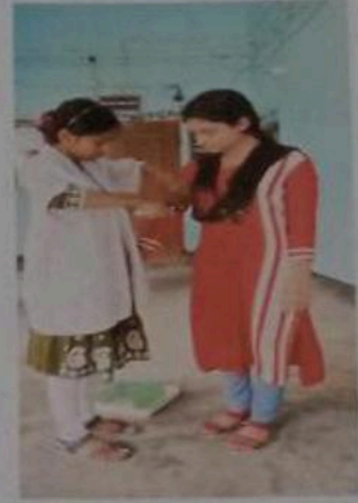
Plate 2 : different activities during survey of 17-18 years girls Bhupatinagor II block.